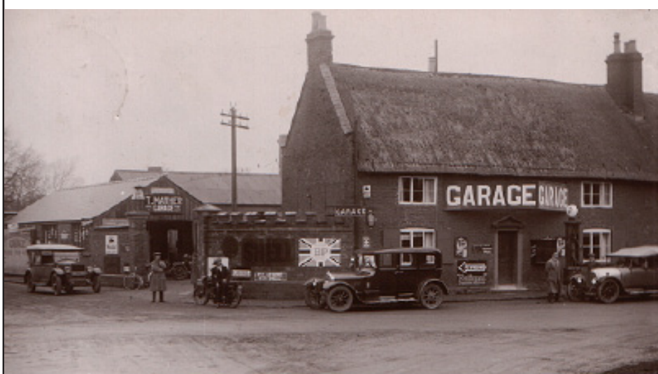
TEL. 11 HUSBANDS BOSWORTH. HIRE CARS, TYRES, ACCESSORIES, REPAIRS.

Images from the Historical Society's Archive Collection