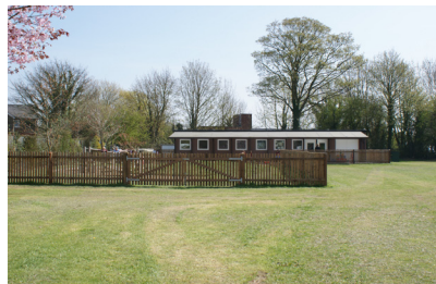
'The Field Rooms' is our fantastic modular building, which provides our children with instant access to outdoor learning.

This mix of old and modern gives our children a real sense of history, while at the same time enables us to provide a purpose-built space ideal for a very different 21 st century learning experience.