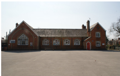
The original school building is now known as 'The Old School House'

Now that we have a flash new building, housing a superb learning environment, our children have decided to give the two buildings a name.