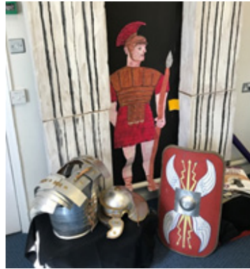
Class 3 – Romans Display

Husbands Bosworth School has been a hive of activity during the last month. Class 1 have begun their topic on traditional tales and using these stories to put on plays, writing to the characters and using them to design houses (that the Big Bad Wolf can't blow down!). Class 2 have been learning about plants and carrying out experiments to see what conditions help plants to grow best. Class 3 have started to learn about the Romans and have already found out a lot about their lives and important events that occurred during these times, such as Mount Vesuvius erupting in AD79. Class 4 have been reading Kensuke's Kingdom and using this to illustrate their topic about 'Storms and Shipwrecks'. I would also like to add that we are all very proud of our Year 6 children who have completed the 'SATS' tests. They were calm and very mature in their approach and tried their very best, which is all we could ask from them.