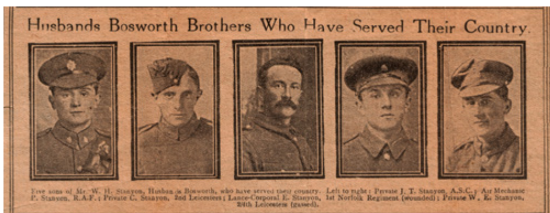
Sons of Bosworth. Five sons of W H Stanyon answered the call... and returned.

Please come along to these events and show your support.