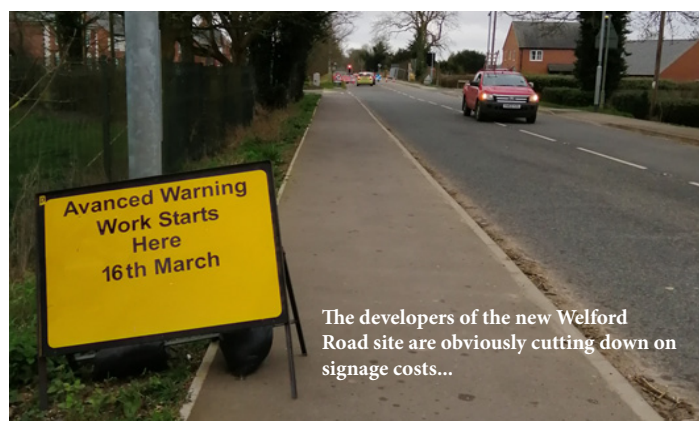
The developers of the new Welford Road site are obviously cutting down on signage costs...

It's vitally important therefore that we support these services and businesses during the crisis, where we are able, and continue to help them as they emerge through the other side.