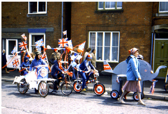
Above: Bosworth's processional celebration for the Queen's Silver Jubilee in June 1977, showing a BMX cycle squadron in close formation with a splendid TWA Jumbo.

Car parking will be limited, so please walk up to the field if possible. Tea, coffees and soft drinks will be available from the pavilion servery during the afternoon, where there will also be an exhibition of local art and craft work. There will also be information from the various village activity and interest groups on display.