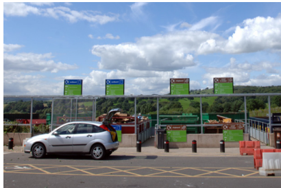
New layout at Kibworth Waste Site

Please arrive at least 10 minutes before closing time.