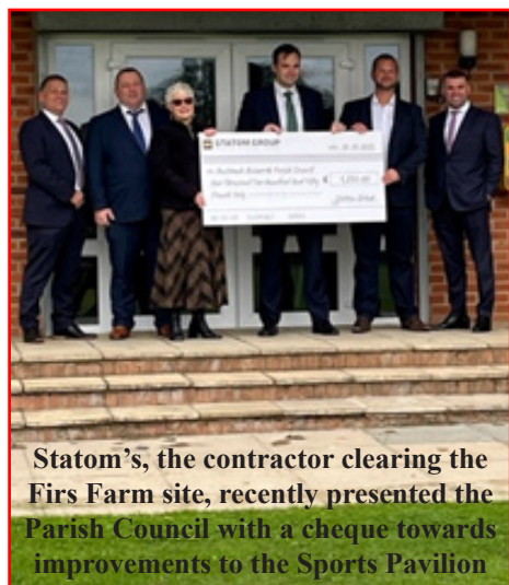
Statom's, the contractor clearing the Firs Farm site, recently presented the Parish Council with a cheque towards improvements to the Sports Pavilion

Locally the state of the footway between Husbands Bosworth and Theddingworth, which is overgrown, and the footway between Station Road and Welford Wharf, which is completely lost in places have been flagged up as requiring attention. Look out, also for other areas locally that you have come across that you feel are deterring folk from walking or cycling, such as poor footpaths or overhanging vegetation... The scheme is funding based, with limited resources, so the more representations that are logged in the Council's survey, the more chance that these areas will be targeted for attention. Go to the interactive survey at: https://haveyoursay.leicestershire.gov.uk/leicestershire-cycling-and-walking-infrastructure-plans-round-3 or search: LCWIP for Market Harborough Area