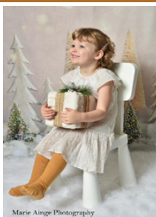
Marie Ainge Photography