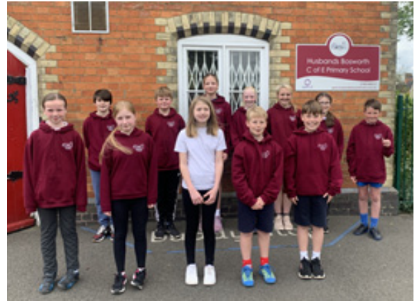
Year 6 Leavers July 2024

The School has launched a new initiative to encourage our children to volunteer and support the community - our new School Badge Awards. Designed for children in Years 3 – 6, the badges will encourage the children to volunteer their time to organise charity fundraisers, eco events or to give up their time for a club. In exchange they can earn their School Badge and a small reward. If any reader of the Bugle would like to suggest ideas the children can get involved in, please email: office@hbs.learnat.uk