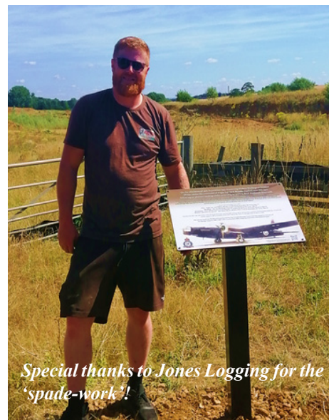
Special thanks to Jones Logging for the 'spade-work'!