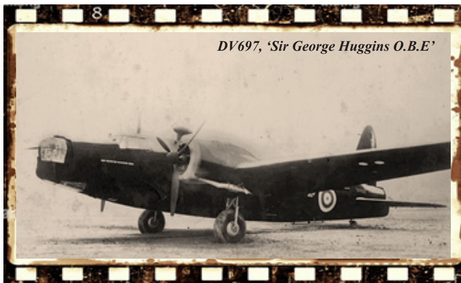
DV697, 'Sir George Huggins O.B.E'

aircraft was one of three paid for by the Trinidad Bomber Fund and named for a prominent West Indies businessman.