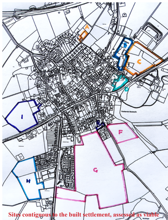
Sites contiguous to the built settlement, assessed as viable